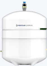
with optional wall mount

Meets combi oven and steamer equipment water quality standards; reduce scale and corrosion problems due to high TDS, water hardness*, and chlorides†