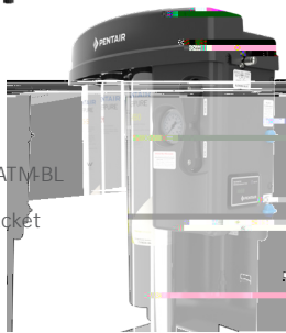
EZ-RO 650/50ATM-BL four stand bracket