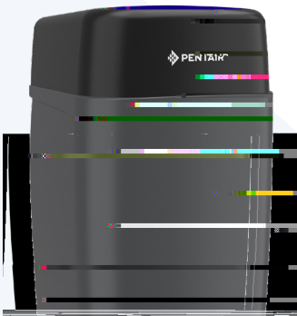
50-gallon atmospheric tank

*Not performance tested or certified by NSF.