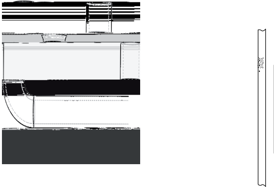
GloBrite White Light Niche (Fiberglass pool) Installation Diagram