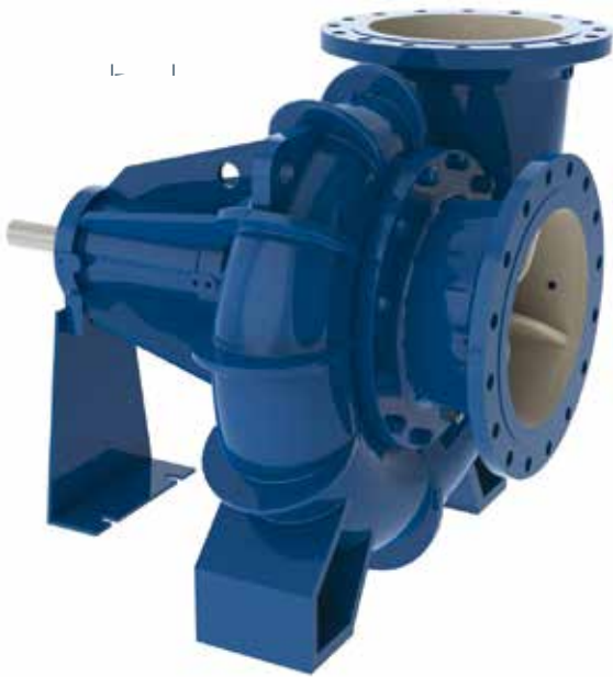
Horizontal view of the HMF pump configuration.